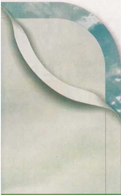
Selective adhesive exposure on a large die cut

These are just a few of the things that are possible with die cut masks. So talk to a masking supply company such as Caplugs or Greentree and ask about taking your die cut masks to the next level.